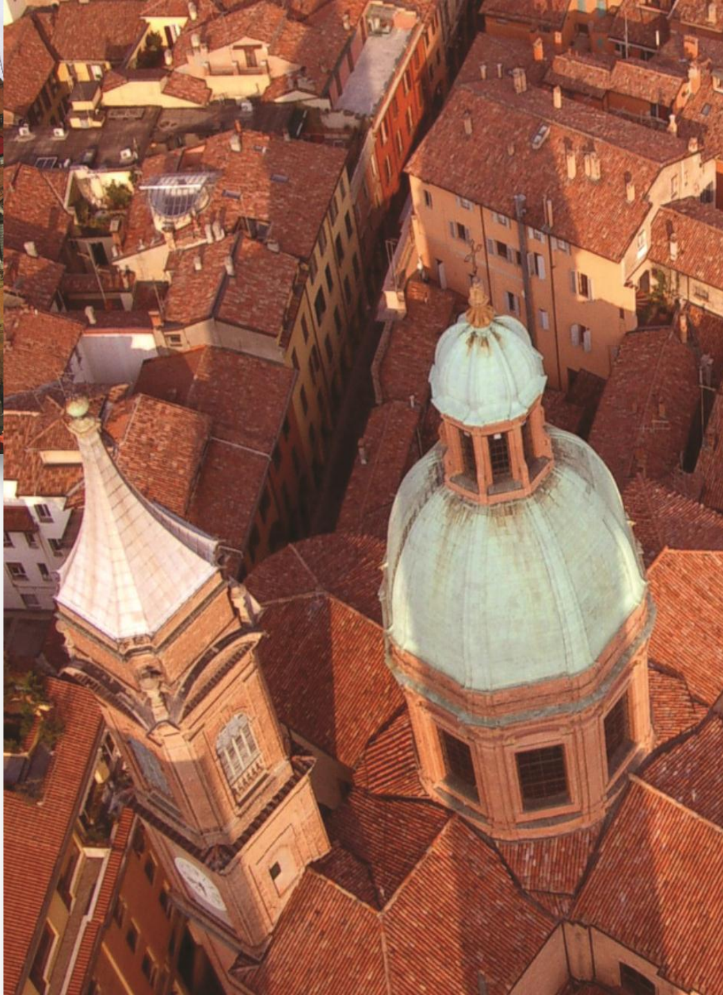
Italy (Bologna & Siena)